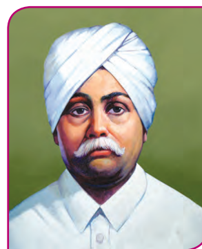
Lala Lajpat Rai