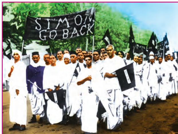
Simon Go Back

In 1928, the commission arrived in India. Wherever it travelled, the people made demonstrations against them, by